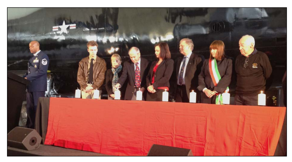
The Nuthampstead Airfield Museum acknowledged at the Reopening of the American Air Museum at IWM Duxford

Imperial War Museum Duxford's transformed American Air Museum , containing the best collection of American aircraft on display outside North America, opened to the public on Saturday March 19, 2016 after a major redevelopment.